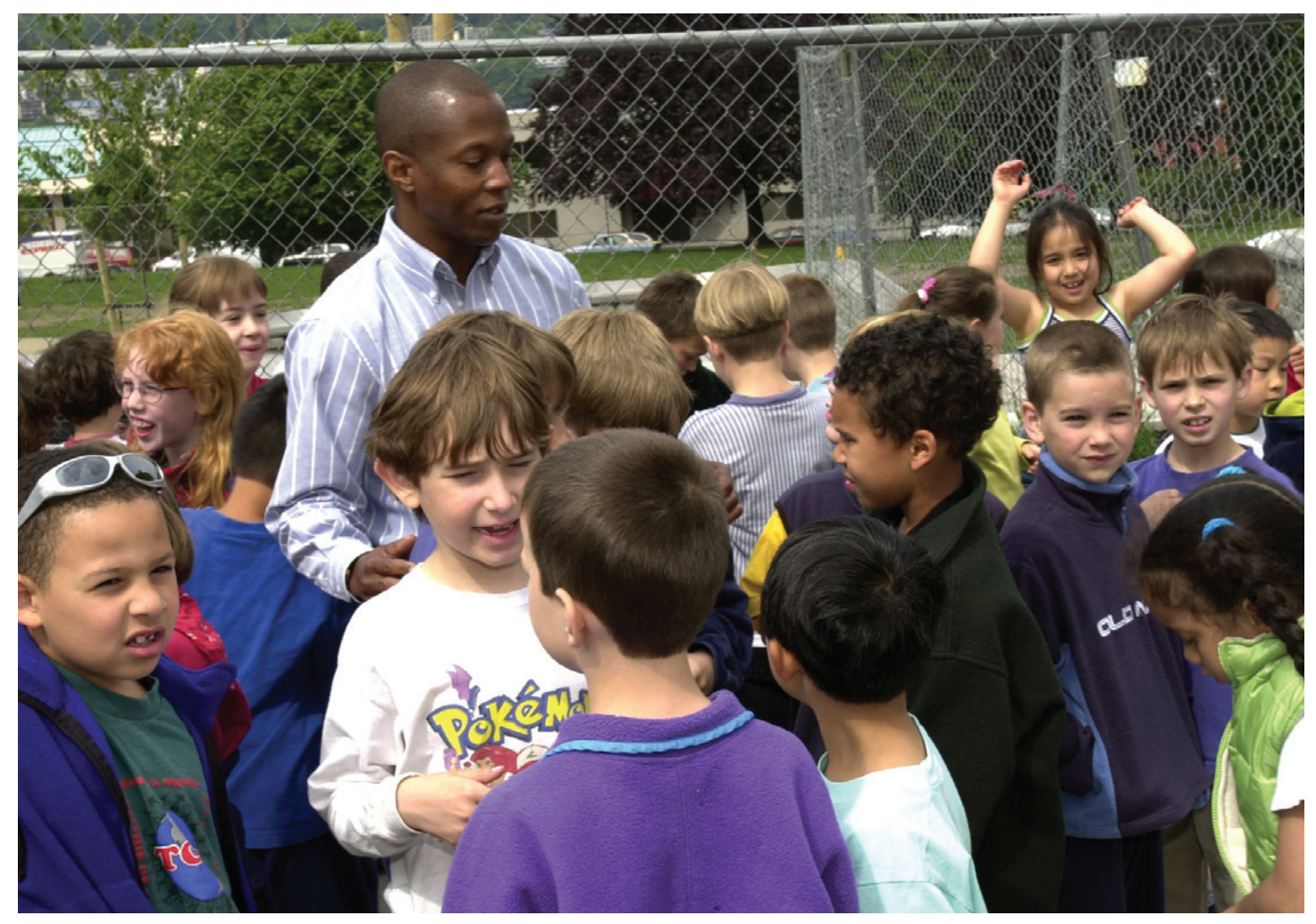
After school programs.

The community wants to hear about how organizations are working together to help improve the community. If the end goal of your shared use agreement (e.g., a youth soccer league, an after-school recreation program for elementary school kids, etc.) fulfills an important community need, be sure to highlight the relationship that made it happen. Particularly in rough economic climates, people like to learn that local government entities and community organizations are collaborating and being resourceful.