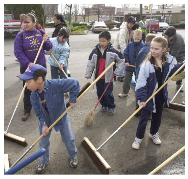
Clean Seattle - Clean Sweep in Lake City - Students from Olympic Hills Elementary School.

Many shared use agreements are available online, and a cross-section of those are included in Appendix B. You may be able to borrow language from other agreements and then make edits to meet the terms and conditions of your particular agreement.