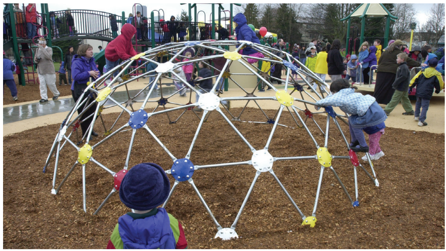
Edwin Pratt Park.

Communities have been carrying out shared use agreements for years, but may call them joint use agreements or interlocal agreements, and agreements may be informal rather than formalized in writing. Agreements are often written only for two specific entities sharing space, but some communities have elected to take a systems approach, implementing a "blanket" agreement that covers various types of arrangements. No matter what name it goes by, or the breadth of its approach, shared use brings different players together to better serve the community.