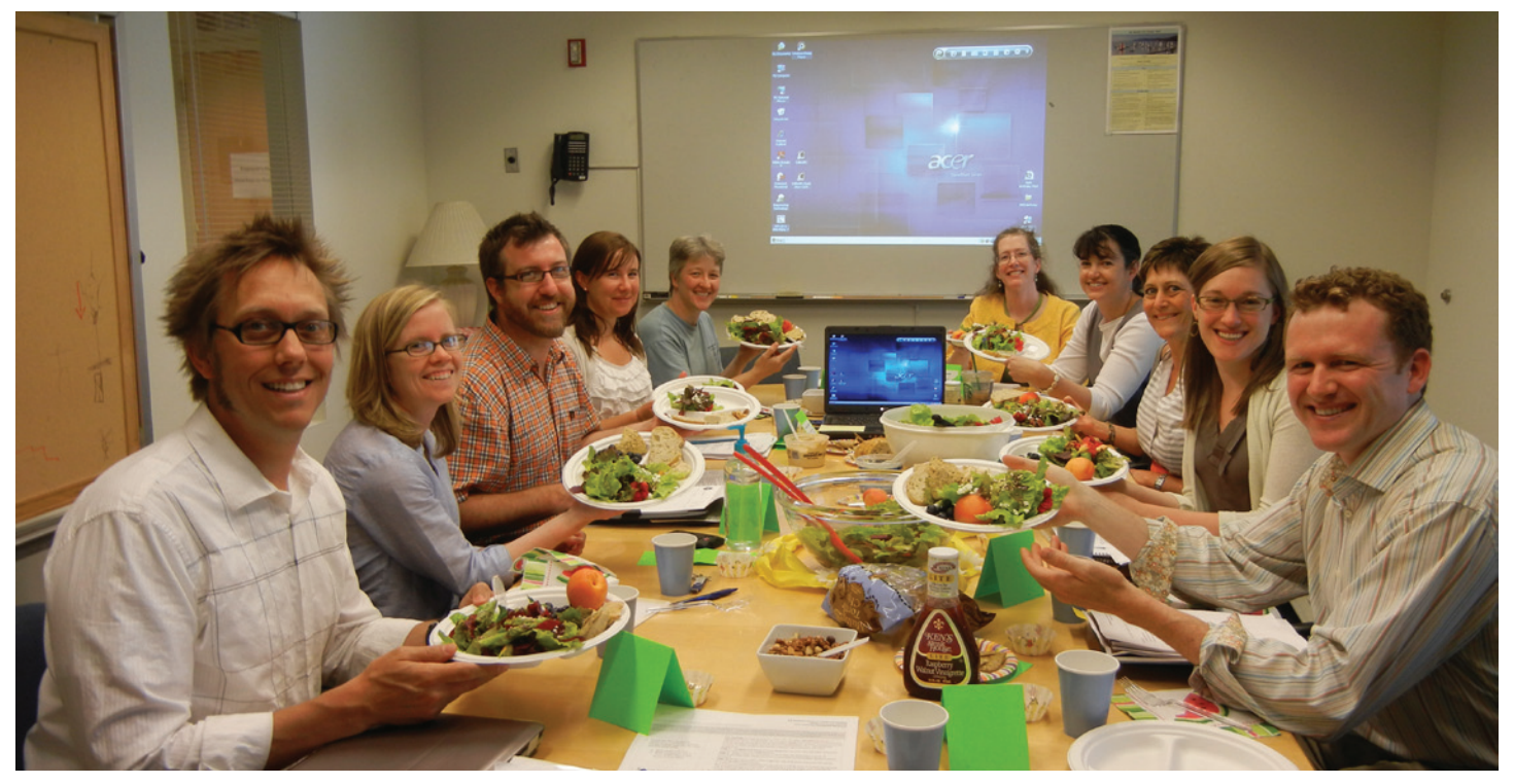
The City of Des Moines shares space with the Des Moines Area Food Bank, University of Washington, Urban Foodlink, CollinsWoerman, and SVR Design Company to strategize increasing access to healthy foods.

You can learn a lot about your partners by doing some research. Most organizations have websites that