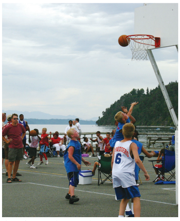
The City of Des Moines shares space with community partners to increase opportunities for physical activity.

Increasing access to opportunities for both physical activity and health eating is particularly important given the increasing prevalence of obesity in Washington State. In 2009, 62% of Washington adults were either overweight or obese.¹ Additionally, in our state, a troubling one out of every four tenth grade students is overweight or obese.² Numerous studies have established the harmful effects of obesity. Obese children are more likely to have high blood pressure, high cholesterol, type 2 diabetes, and asthma.³ They are also at a greater risk for developing social and psychological problems, such