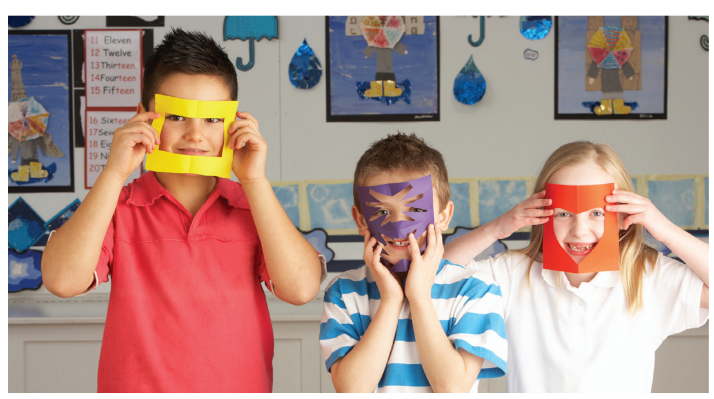
After school programs.

Tip: A lot of decisions go into forming a comprehensive shared use agreement. Be sure to take minutes to document decision points, and refer back to them at future meetings if needed.