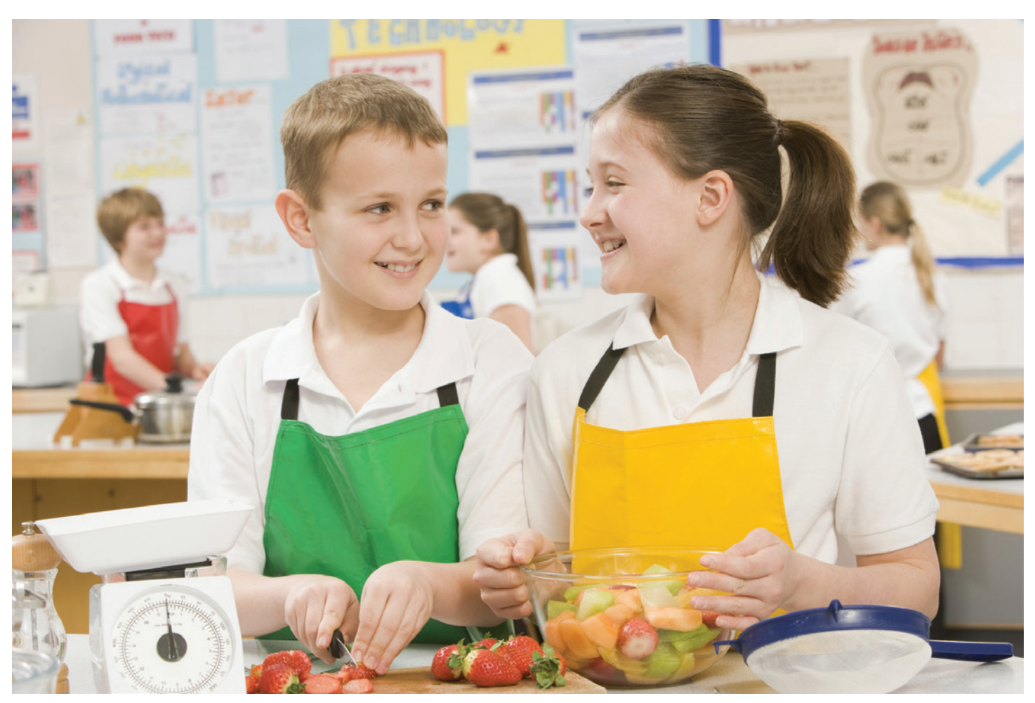
Children learning about healthy meals in after school programs.

In this toolkit, we focus on shared use agreements that support activities for healthy living.