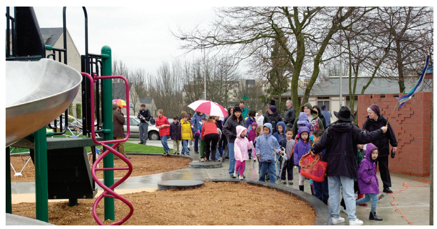
Edwin Pratt Park, Photo: Seattle Municipal Archives.

Furthermore, partnerships are created and strengthened through shared use. Community players who have never interacted with each other may come together to form and carry out a shared use agreement to serve the needs of the community. When public and private organizations have strong relationships with one another, they can better respond to challenges or new demands from the community.