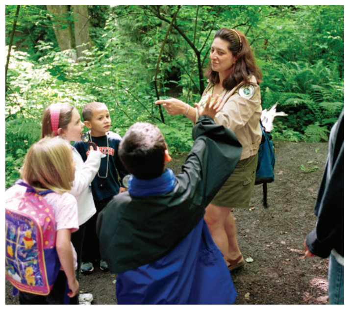
Naturalist teaching environmental education class to children, Camp Long (park), West Seattle.

This may seem obvious, but forging successful shared use is about relationships. When you are approaching a new partner, it is important to be flexible and understand that you may not receive access to all the facilities you want. Property owners are often concerned about additional maintenance costs and damage to their facilities, so it's important to prove that you are respectful of their space and that you are a responsible facility user. Once you establish a good working relationship, you can revisit the agreement and negotiate additional spaces or alternative spaces for your activities.