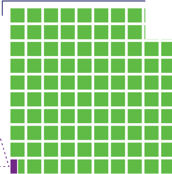
U.S. Total Land Area

less than 5% of land area lies within MPO boundaries