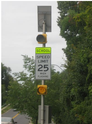
Figure 2. Example of school speed limit sign.

Generally, the reduced school speed limit zones should be in effect only during specified intervals such as at the start and end of a school day. While the transportation agency responsible for the roadway operations and maintenance installs the signs, the times are generally set through consulting with the local school district. Close cooperation is needed between school officials and those who operate the roadway.