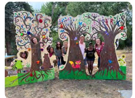
Primos Park (Boulder, CO)

Boulder, Colorado (2024 Grantee, PLAY Boulder): In 2023, Boulder Parks and Recreation (BPR) began planning a park for North Boulder’s largest manufactured housing community. During park design, residents raised concerns about park access, especially for kids and people with disabilities. We worked with PLAY Boulder and BPR to connect with the city’s Transportation and Mobility team. Together, we conducted a walk-and-roll audit and hosted a Safe Routes to Parks workshop. This collaboration led to temporary and permanent safety improvements on the routes to the park. The team drew attention to the work with a block party, adding temporary signage designed by residents that celebrated the new park name and temporary mats and ramps for people with limited mobility. They invited key decision-makers to the event. As a result of this increased attention and engagement the city earmarked $7.5 million in city funds for a bridge replacement near the park.