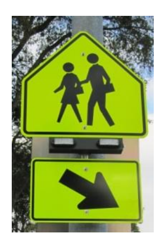
Figure 3. Example of the rectangular rapid flashing beacon being used with school sign.

The pedestrian hybrid beacon (PHB) (also known as the HAWK) is located both on the roadside and on mast arms over the major approaches to an intersection (see Figure 4 for an example). The head of the PHB consists of two red lenses above a single yellow lens. It is normally "dark," but when activated by a pedestrian, it first displays a few seconds of flashing yellow followed by a steady yellow change interval, and then displays a steady red indication to drivers, which creates a gap for pedestrians to cross the roadway. During the flashing pedestrian clearance interval, the PHB changes to a wig-wag flashing red to allow drivers to proceed after stopping if the pedestrian has cleared the roadway, thereby reducing vehicle delays.