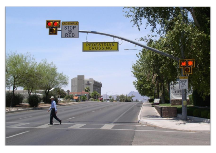
Figure 4. Example of a Pedestrian Hybrid Beacon (HAWK) treatment in Tucson, AZ, USA. ^{\rm 16}

The device was developed in Tucson, Arizona, USA, which now has more than 100 installations, many at school crossings. A recent study conducted a before-and-after evaluation of the safety performance of the pedestrian hybrid beacon <sup>16</sup> and found: