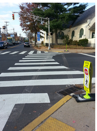
Left: New Warren Street bike lane in Trenton, NJ Right: New crosswalk at Olden/N Clinton in Trenton, NJ